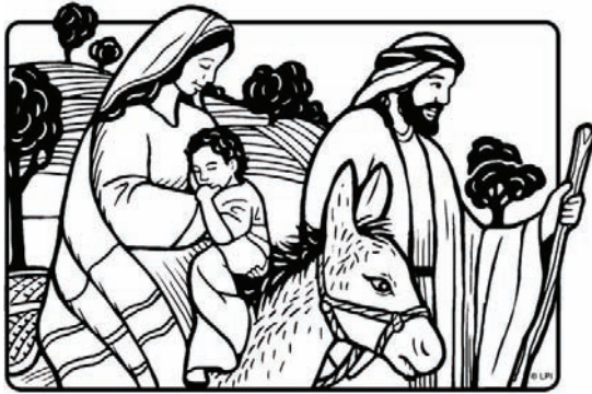
Holy Family of Jesus, Mary & Joseph 29 December 2019

And after being warned in a dream, he went away to the district of Galilee. There he made his home in a town called Nazareth, so that what had been spoken through the Prophets might be fulfilled, "He will be called a Nazorean." Matt 2:22b-23